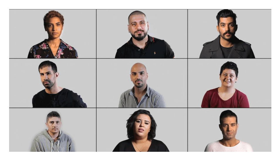
From "No Longer Alone: LGBTQ Voices from the Middle East and North Africa